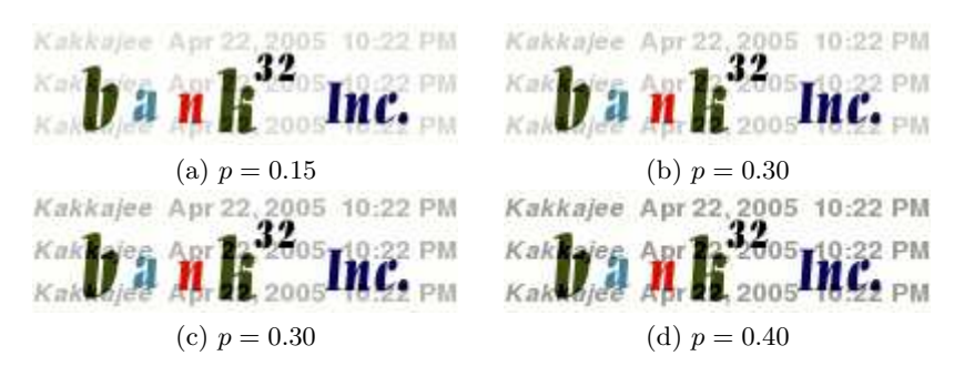
Fig. 3. Logo images watermarked with ImageMagick^{TM} using various p values

In order to preserve the aesthetics of the cover logo image, we used RGB (midpoint, midpoint, midpoint) as the background color in our watermark images. This is because, with these RGB values, the corresponding offset^w values, in Equation 5, become 0.